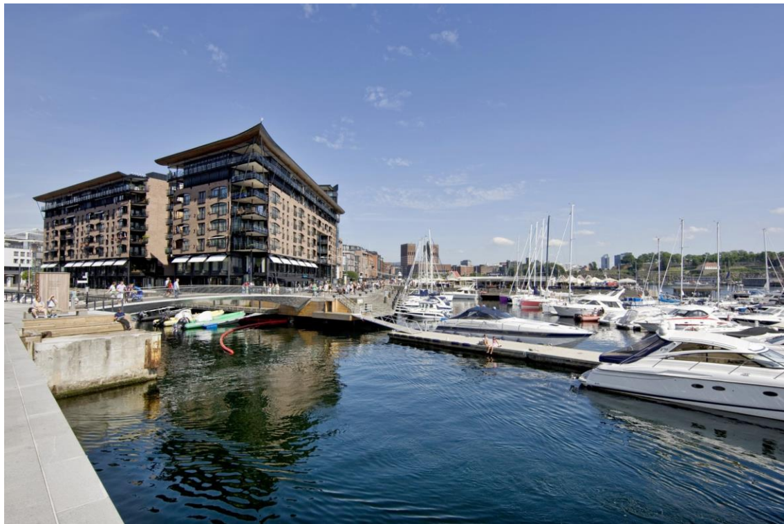
Aker Brygge, Oslo