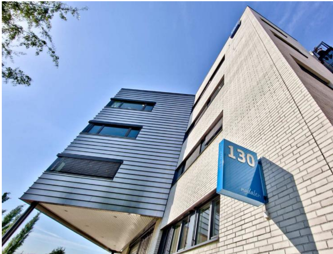
Sandakerveien 130, Nydalen